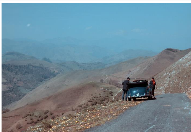
Impressions of the tour

When this great GP track (like in Monaco) running along the coast was closed forever and opened to traffic in 1977, a new race track was built inland: the Grobnik Circuit. Of course we will drive there as well, as at the Red Bull Ring later in Austria, which we definitely want to integrate. There is still a lot to report in the next issues